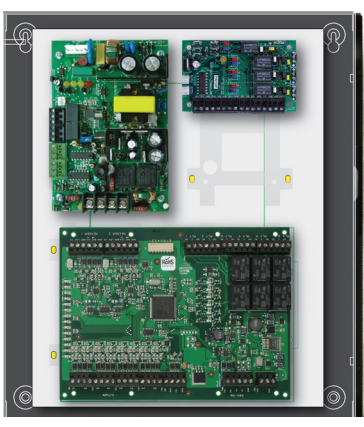
• EP1502 with lock control

304 Terrace Drive Mundelein, IL 60060 USA